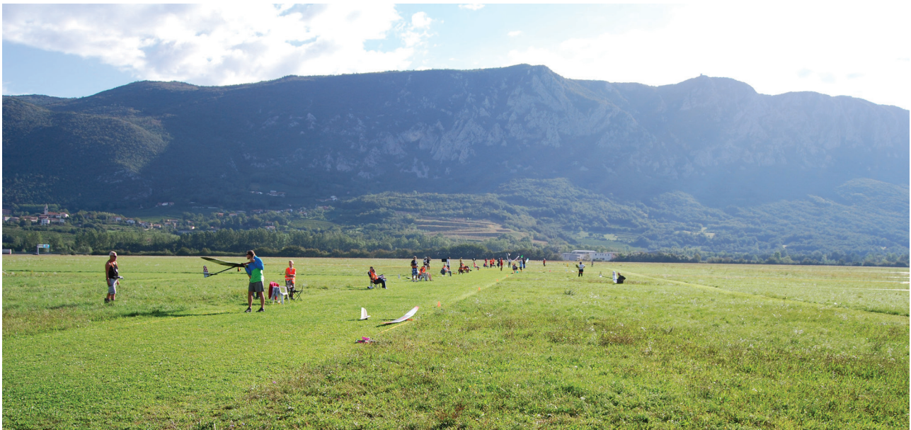
Photo of Venue

There will be no “no-fly” zones at our competition, meaning there won’t be any limitation as to where you can fly. The surface of the airfield is sufficiently large to provide an interesting and invigorating competition! The event will be held at the peak of central Europe’s summer, so that estimated temperatures are expected to reach approximately 30°C (and up to 35°C) with humidity levels at about 60%.